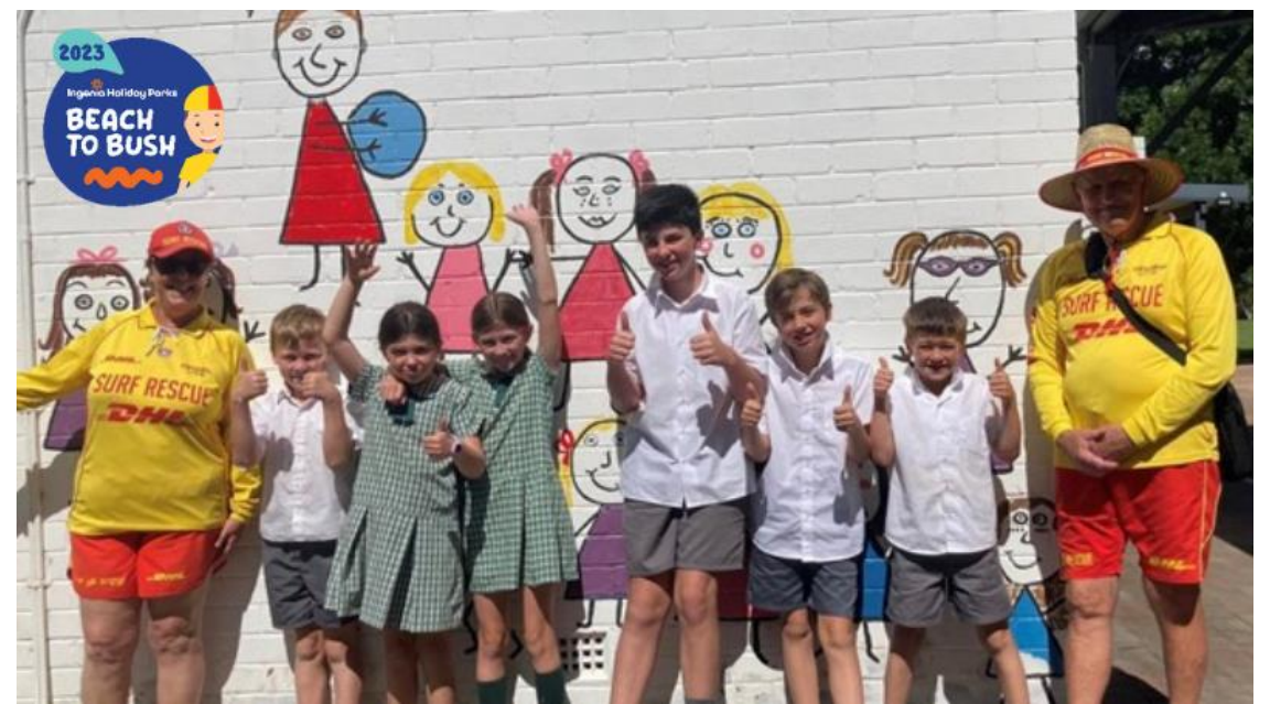
<u>Big Beach Week:</u> we bring you a whole week of FREE beach and water safety activities to help your students prepare for summer!

If your primary school would like to be part these FREE sessions you can register here.